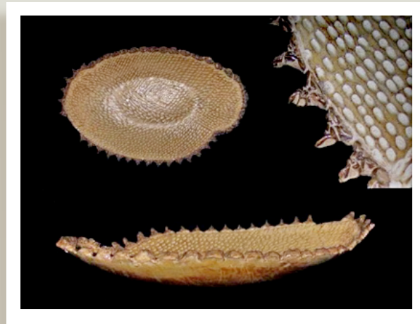
"African Tan" by Louise LaLande

This is to say, lighting illustrates, instantly and provocatively, the innate tensions within the human condition: Darkness is much more than the absence of light: it's an entire world of concealed form. When light emerges it brings from out of the darkness a meaning, a relationship to more than can be described with words.