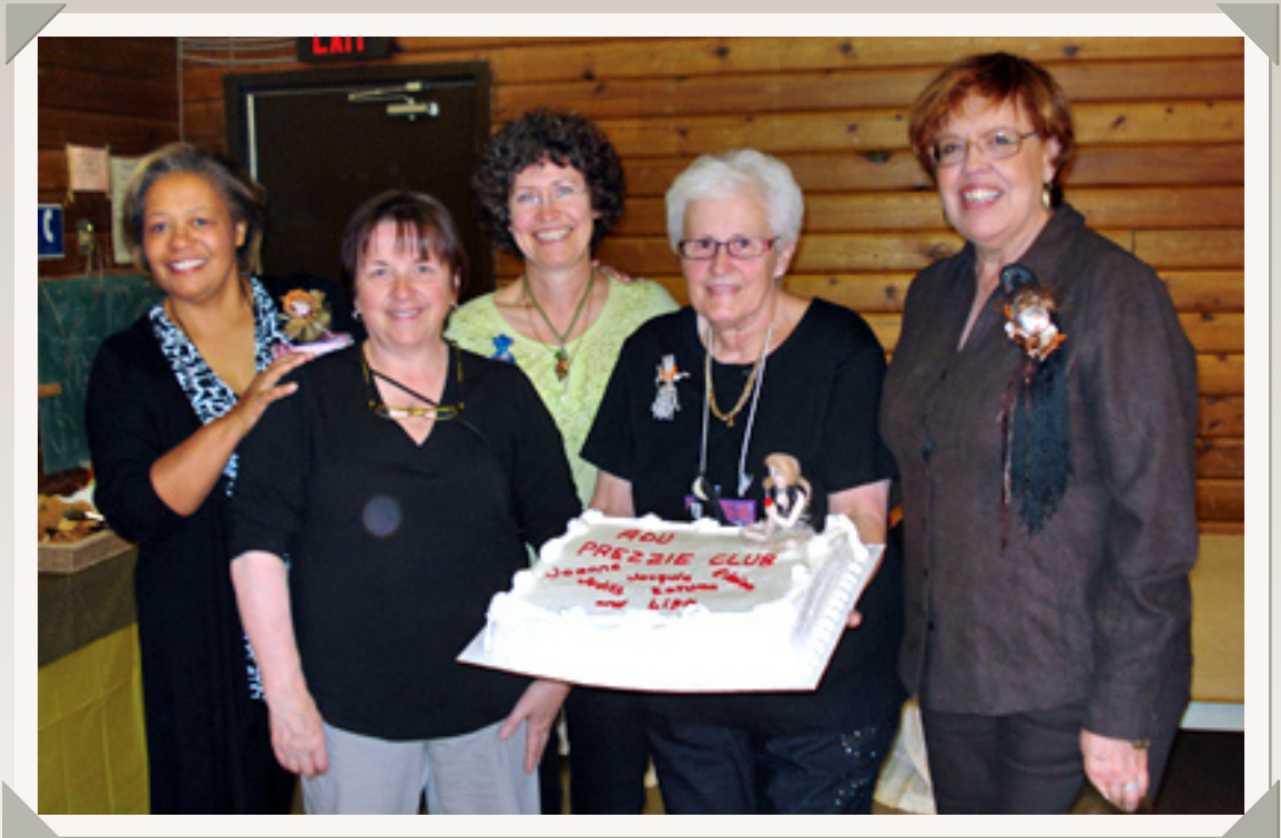
Maki House, October 19, 2008

All Dolled Up · Ottawa's Cloth Doll Club · Year 12 · November 2008 · Issue 58